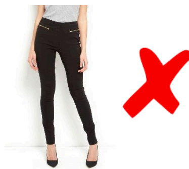
Skin tight trousers are NOT acceptable.