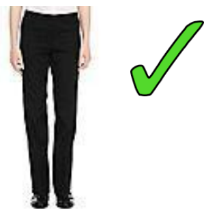
An example of acceptable girl's trousers.